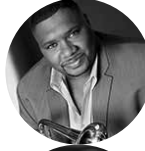
Wycliffe Gordon Trombonist